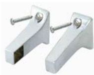
Chrome Plated Exposed