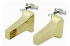
Polished Brass Concealed