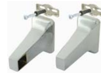
Chrome Plated Concealed